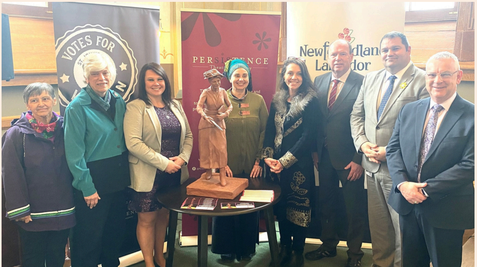
At the provincial funding announcement April 2023.